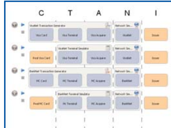
Collis Host Test Tool

Collis has developed the Collis Host Test Tool; a new host-test-platform. It is able to simulate any card, terminal (POS/ATM), Acquiring Host, Network Host (Visa/MasterCard) and Issuer Host to test any host system. Whether you have an Acquiring Processing Host that needs to be tested; an Issuer Authorisation Host or a Switch that needs to be tested, Collis Host Test Tool can help you. Surrounding elements can be simulated; transactions can be generated and all kinds of tests can be executed in an automated manner. This test tool is part of a complete suite of test tools available from Collis for Acquirers.