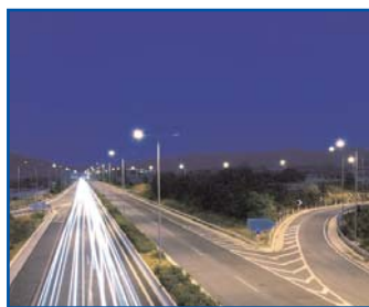
e-Road Pricing Specifications

At the end of November 2007 the Dutch cabinet decided to go ahead with the kilometer charge. Road users will be faced with this system of payment per kilometer from 2011, with the system being fully operational by 2016. This project means the development, installation and testing of 8 million On Board Units and a central Back office for billing, customer care and enforcement. The On Board Units will use GPS technology for location determination, DSRC for communication and GPRS for communication of the registered kilometers.