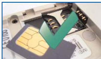
New Spying Platform

More information: www.aspectstools.com/spytools/smartstation3_LE.shtml