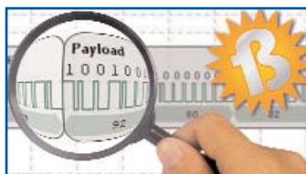
Spy functionality for SWP/HCI

Aspects' new spy tool, Aspects Spy, is in Beta testing. Aspects Spy adds support for SWP (Single Wire Protocol)/HCI (Host Controller Interface) and introduces an improved user interface. SWP is related to NFC (Near Field Communication – Mobile Commerce). Aspects Spy's complete translation coupled with powerful searches and filters help speed up error finding on the interface between mobile handset and (U)SIM.