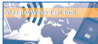
Visa payWave Acceptance

With its user-friendly graphical interface, the Visa payWave Test Tool enables you to carry out all tests according to the latest Visa payWave Procedures and Visa Europe implementation requirements in an efficient manner. This Test Tool guides you step-by-step in installing and setting up the software and hardware.